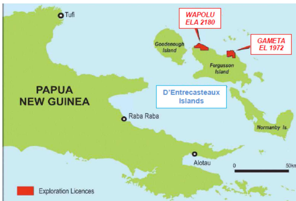
Figure 2 – Location of Gameta and Wapolu deposits, Fergusson Island, PNG

The Gameta gold deposit and the Wapolu gold deposit, located in close proximity to each other on the north-coast of Fergusson Island in Papua New Guinea, comprise the Company's Fergusson Island Project, upon which over $15M has been spent since 1996.