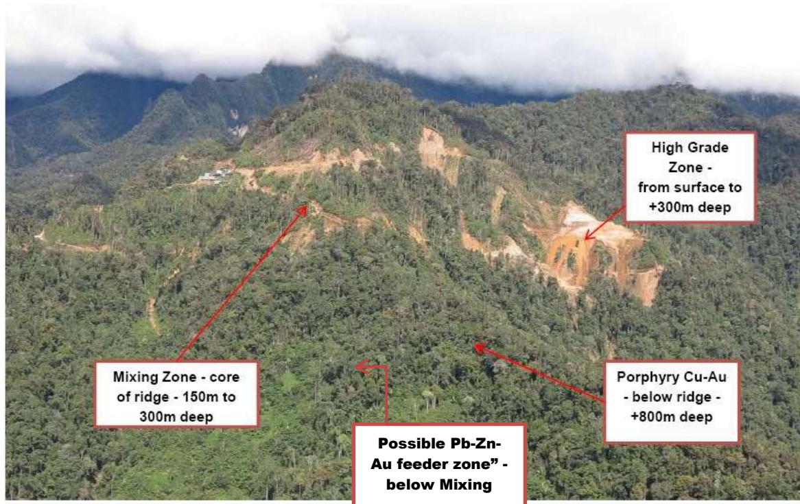
Figure 1 - Nevera Prospect